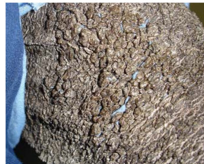
Left upper anterior arm before treatment, close up. Note fibers from patient's clothing imbedded in skin scales.