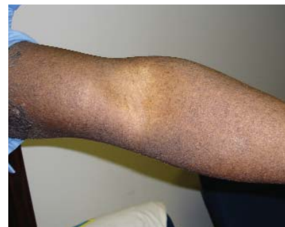
Left anterior arm completely clear and free of scales in treatment area after less than four weeks therapy with the Olivamine containing skin care products.