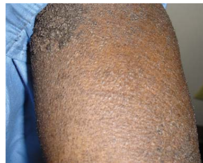
Left anterior arm close-up shows nearly normal skin after three weeks treatment with the Olivamine containing skin care products.