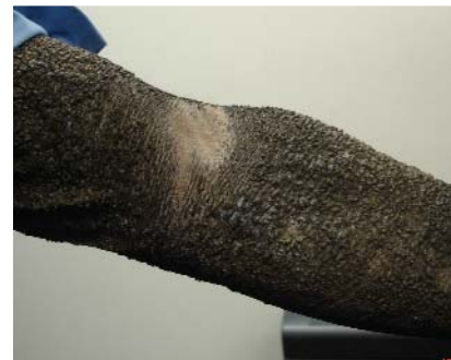
Left anterior arm before treatment